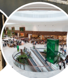
AÉROVILLE SHOPPING CENTRE