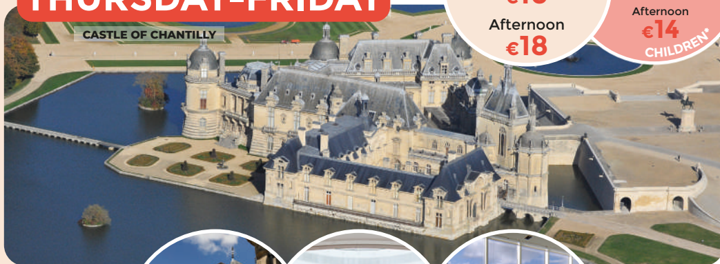
CASTLE OF CHANTILLY