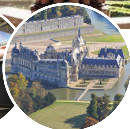
CASTLE OF CHANTILLY