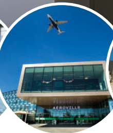
AÉROVILLE SHOPPING CENTRE