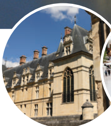
NATIONAL MUSEUM OF THE RENAISSANCE - CASTLE OF ÉCOUEN