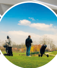
INTERNATIONAL GOLF OF ROISSY