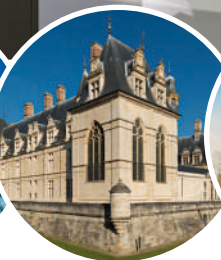
NATIONAL MUSEUM OF THE RENAISSANCE - CASTLE OF ÉCOUEN